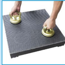
1. Use tools to install and remove cabinets.