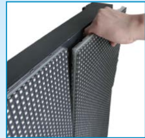
4. Disconnect the ribbon cable and remove the module.