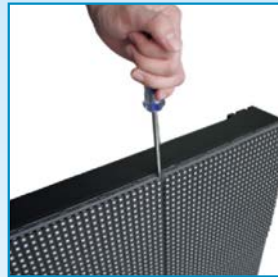
3. Use slot type screwdriver inserted into the gap between the modules.