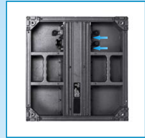
2. Remove the position of screws as shown.